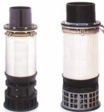
L-200A • 250A L-300A • 1220