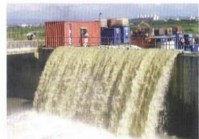
• Flood control